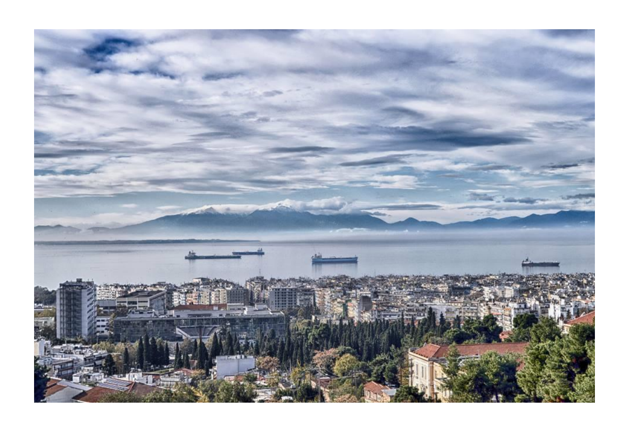
The campus, the city, the sea and Mount Olympus