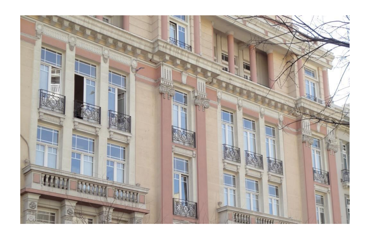
School of Political Sciences, 46 Egnatia Avenue