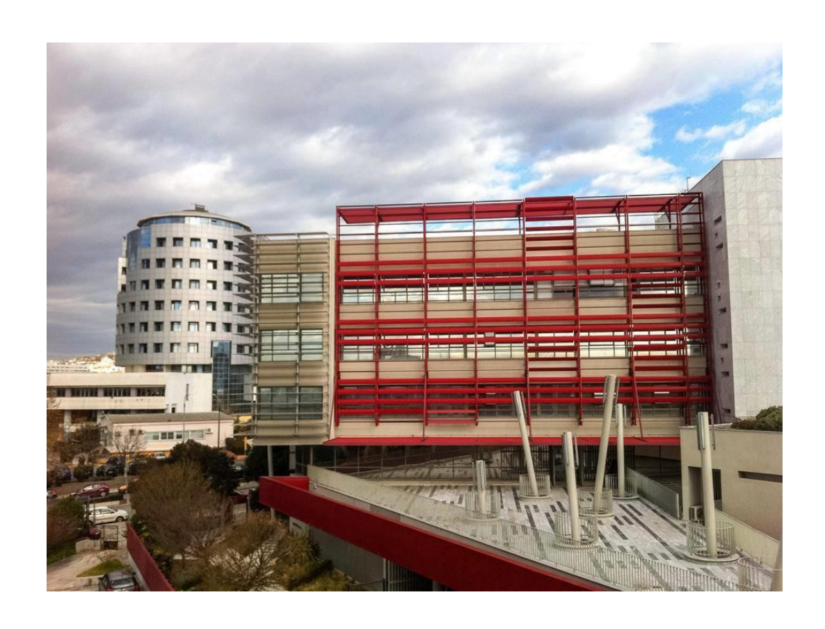
Research Dissemination Centre, Aristotle University campus