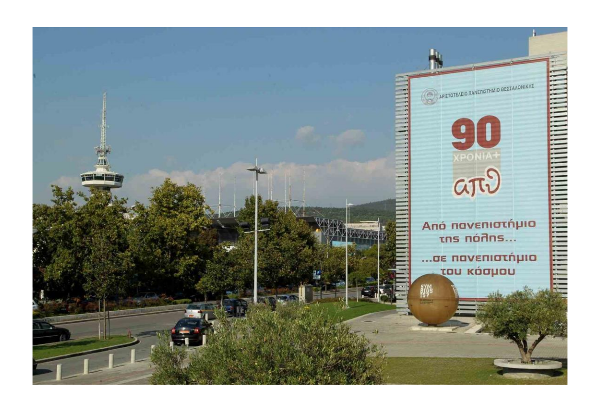
2016: The Aristotle University celebrates its 90<sup>th</sup> anniversary