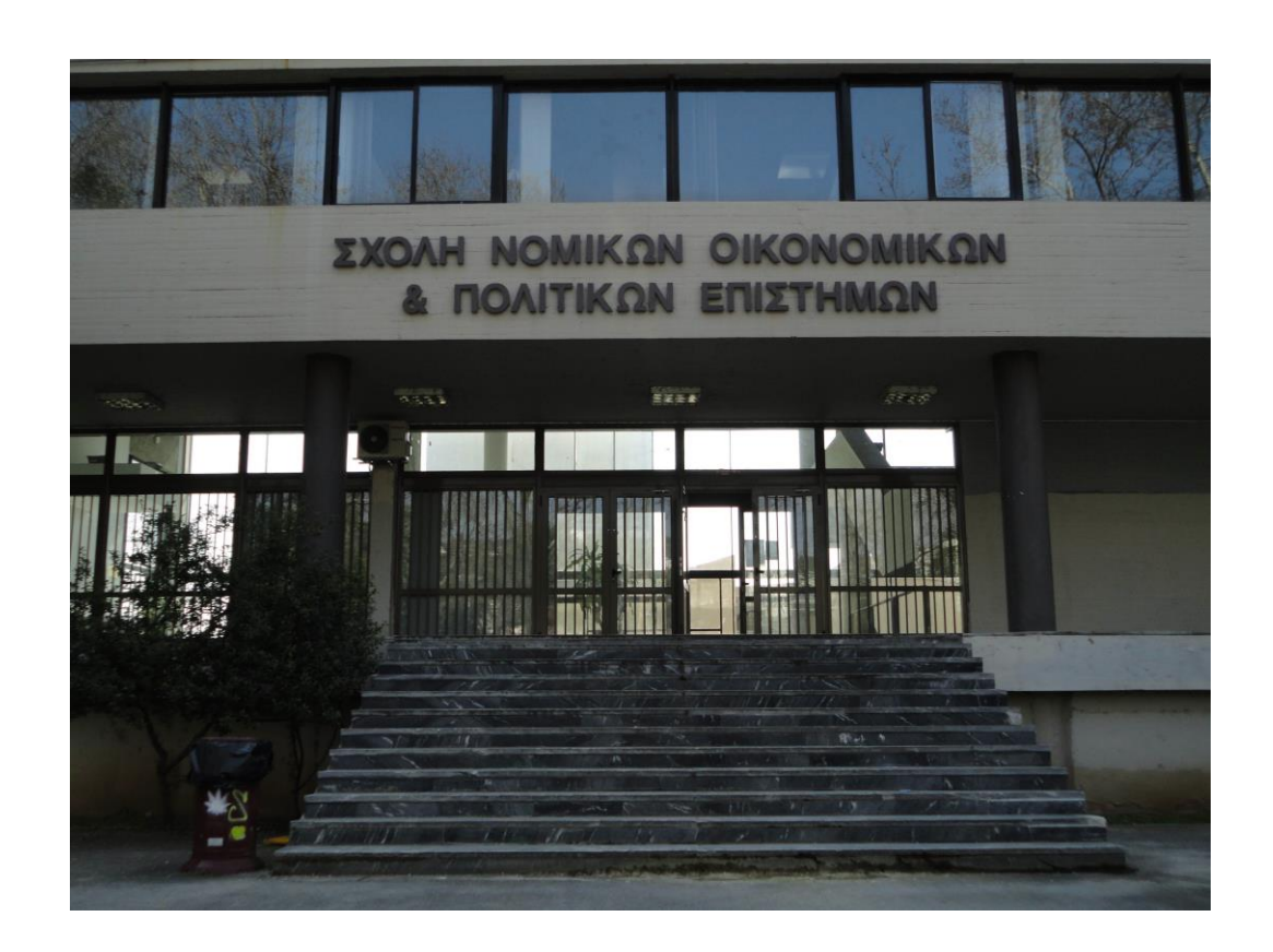
School of Political Sciences, Aristotle University campus